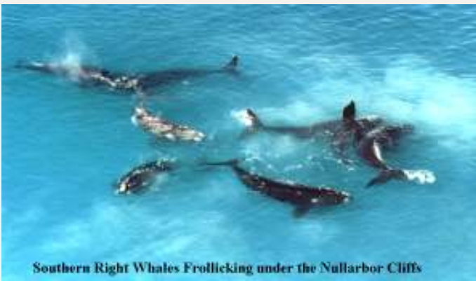
Southern Right Whales Frolicking under the Nullarbor Cliffs