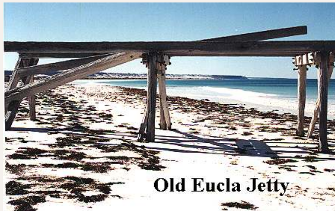
Old Eucla Jetty